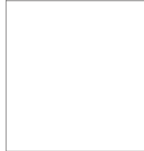
Right index fingerprint of alien removed

_____ (Signature of alien being fingerprinted)